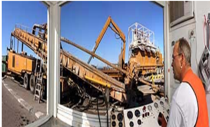
CoeDrill 550 Rig Spread