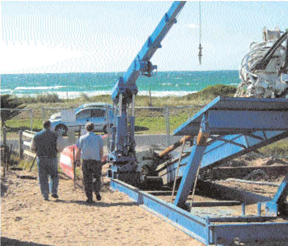
The CoeDrill 90 was used at Stanley, Tasmania.

with its heavy-duty rock plough and jetting attachment.