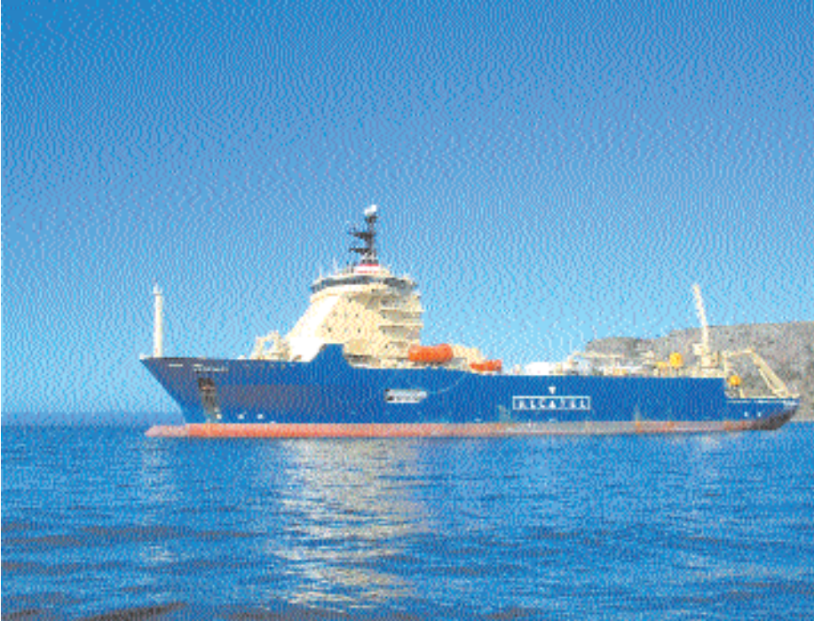
The Alcatel operated cable ship Ile de Batz has a heavy-duty rock plough and jetting attachment.

Coe Drilling Australia, the Horizontal Directional Drilling Specialists, have recently completed two shore crossings for the 240 km long Bass Strait Optical Fibre Submarine Cable No 2 (BS 2) Installation for Telstra