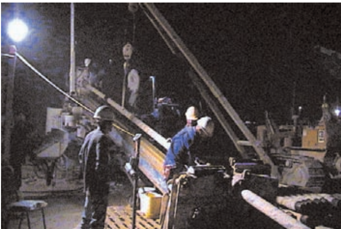
During the project, work continued 24 hrs a day, 7 days a week.

The work involved the design and installation of a 219.1 mm 13% CR Line Pipe under the Chandan Wah Canal close to Dadu in southern Pakistan. The crossing was drilled using Coe's American Augers DD90b horizontal directional drilling rig and mud system which it shipped from Brisbane via Singapore to carry out the work. Work started on drilling the pilot hole in dense sands and following difficulties with the local water supply a Mud Engineer was deployed to site to formulate a mud program to encounter the difficult formations. The low pH levels of the local water needed treatment before a high yielding bentonite