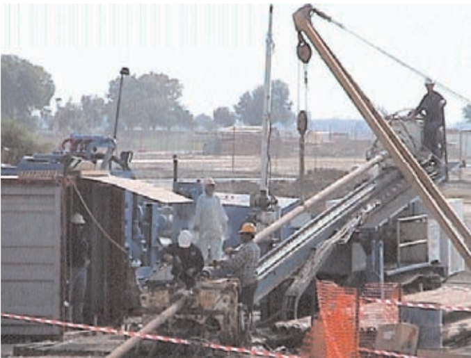
Coe Drilling's DD90b on location in southern Pakistan.

This project also happens to be the first directionally drilled river crossing to be installed in Pakistan. The work involved two crossings on the Zamzama Gas Field to bring the gas from the well to the plant from where it flows into the Southern Sui Gas Company Limited system.